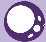
White Fat Cell

GBX Fit supports healthy weight loss through the release of stored fat, from our storage depots in white fat.